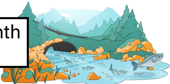
COPPER RIVER WATERSHED PROJECT