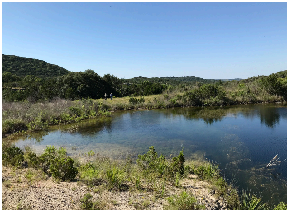
Albert and Bessie Kronkosky State Natural Area.

Restoring Habitat: The dam removal will restore habitat for a unique species of salamander found in the spring system, allowing visitors to experience the new State Natural Area and the restored spring system as nature intended. If left in place, the dam would not only take away from the natural characteristics of the area but would also concentrate use to a single area of the park, potentially creating issues for land managers such as trash and public safety concerns.