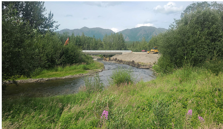
The new bridge over the Little Tonsina River provides important access for communities.

Species benefited: Coho and Chinook salmon