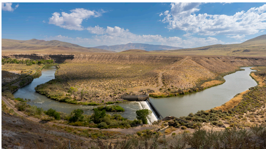
Numana Dam along the Truckee River.

Boosting Economics: The Nevada Department of Wildlife estimates that the Truckee River supports between 60,000 and 100,000 angler days per year, or days spent fishing by recreational anglers. In 2022, recreational anglers spent an average of $47 per angler day on trip related expenses. If the improved fishing opportunities in the Truckee increase fishing by even 5%, it would result in nearly $250,000 added to the economy around Reno and the Pyramid Lake Paiute Reservation annually.