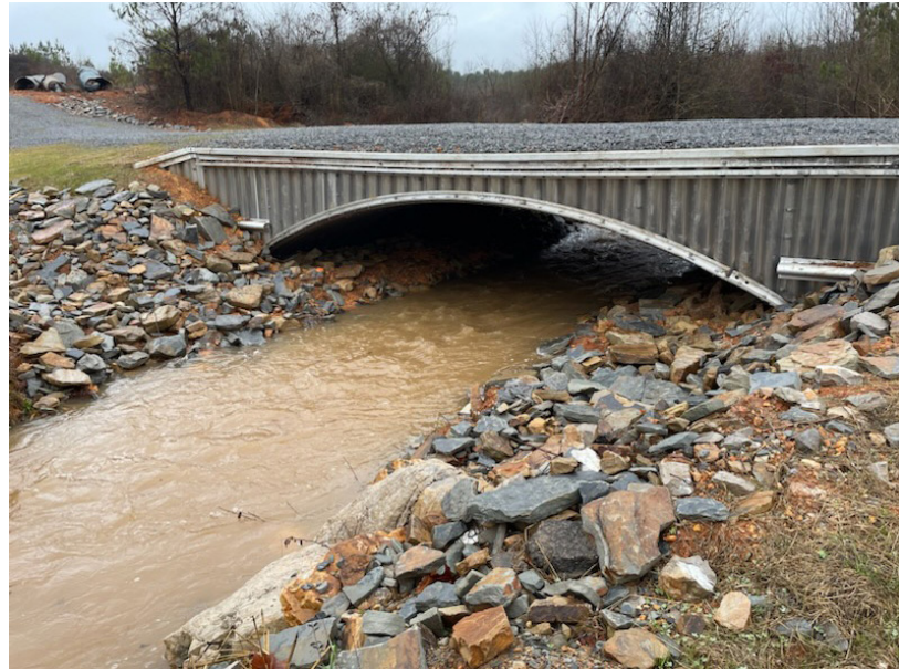
This bottomless arch structure replaced an undersized culvert on a tributary to Little Canoe Creek.