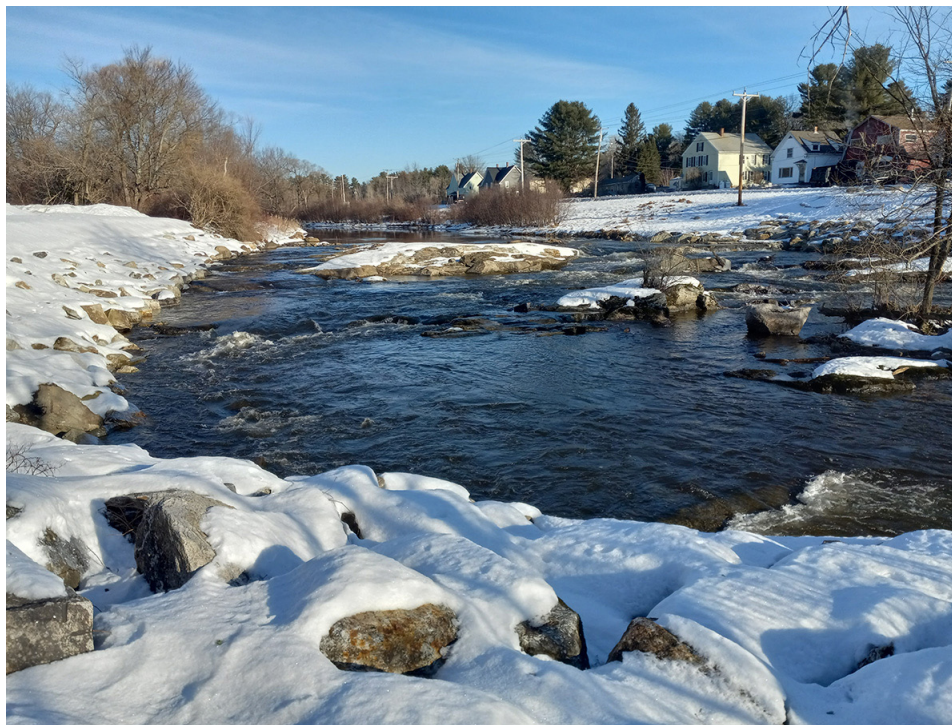
A view of the Sabattus River flowing freely after the removal of Upper Town Dam.

Restoring Habitat: With both dams fully removed, conditions are ideal for fish passage, allowing for potential recolonization of commercially and ecologically important alewife to river reaches above the dams. These dam removals will also restore alewife access to Sabattus Pond, potentially allowing the return of more than a million adult alewives to the watershed each year. Commercial harvest of alewives could provide up to $20,000 annually in revenue for the towns where they are harvested.