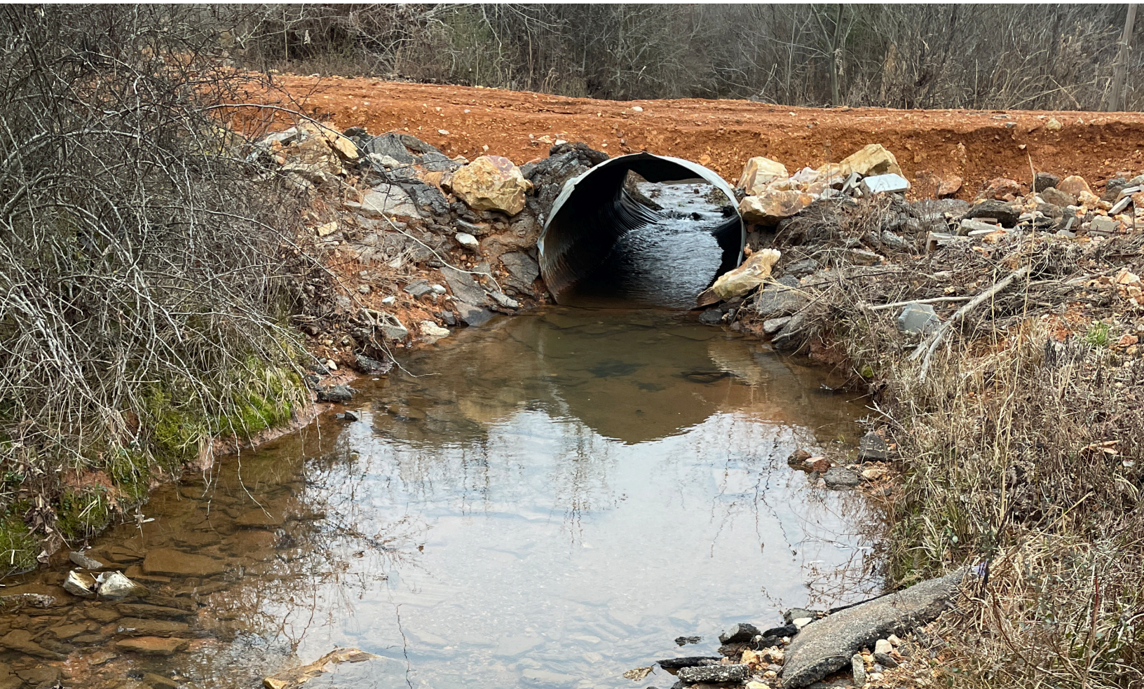
An undersized culvert in St. Clair County, Alabama, caused flooding issues for the local community.

This report will explore these short- and long-term benefits provided by the Bipartisan Infrastructure Law funding through an analysis of project expenditures and a closer look at a set of projects. These case studies illustrate how meaningful these projects can be for their communities.