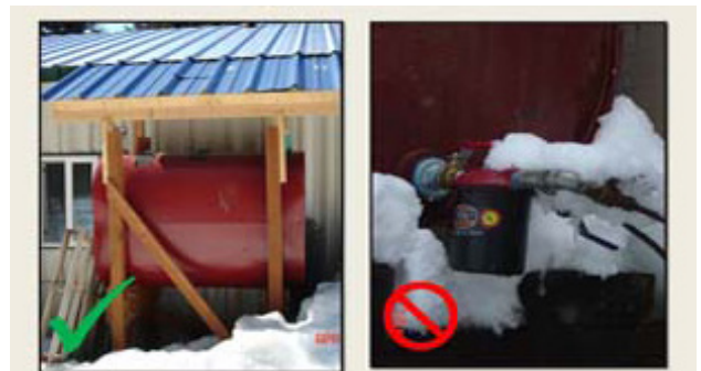
Before the snow flies, take time to protect your tank and lines from overhead damage from ice, snow, or trees!

https://dec.alaska.gov/spar/ppr/prevention-preparedness/hho-tanks