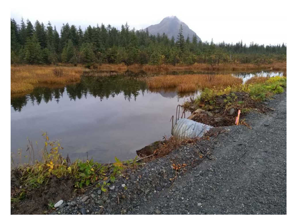
COP 43 upstream side