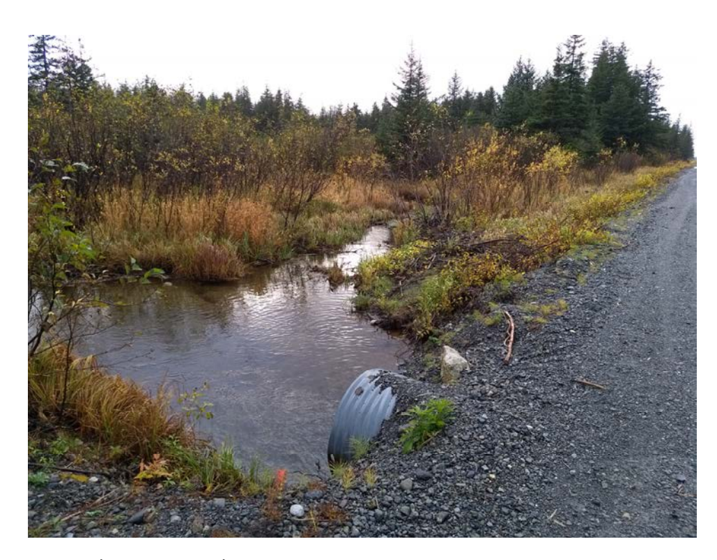
COP 43 downstream side