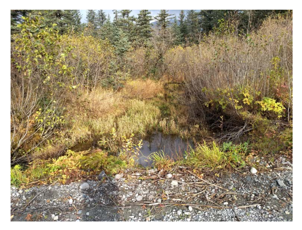
COP 45 upstream side looking upstream from road surface