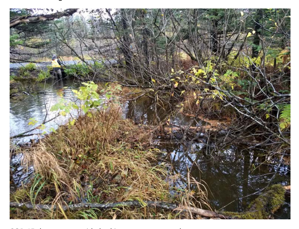
COP 45 downstream side looking upstream to culvert