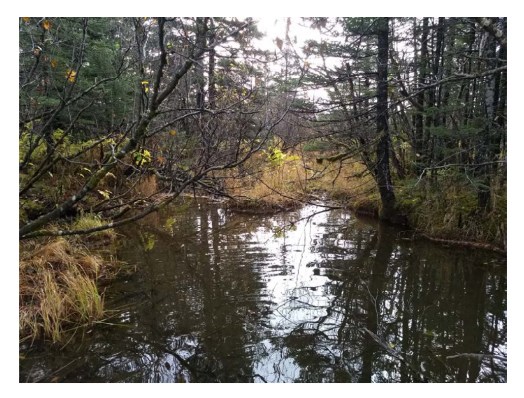
COP 45 looking downstream from culvert