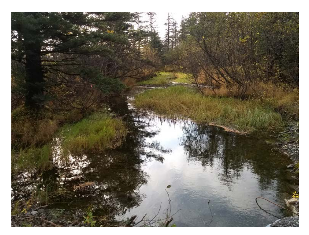
COP 44 Downstream side