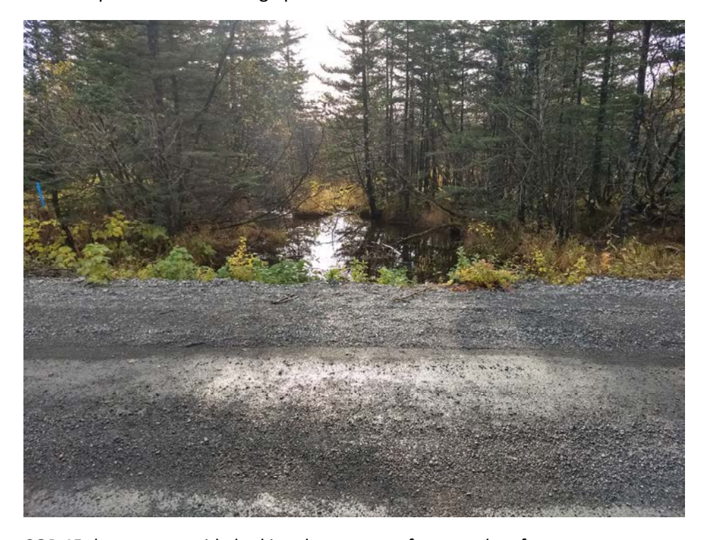
COP 45 downstream side looking downstream from road surface