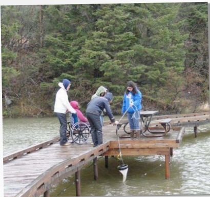
COLLECTING WATER SAMPLE