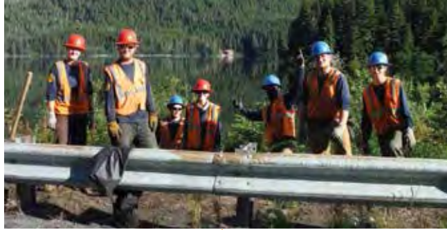
SAGA CREW WORKING ON REED CANARYGRASS INFESTATION ALONG EYAK LAKE.