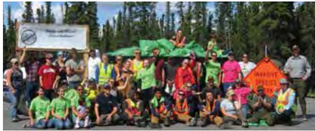
THE 2014 COPPER BASIN WEED SMACKDOWN VOLUNTEERS GLENNALLEN, AK