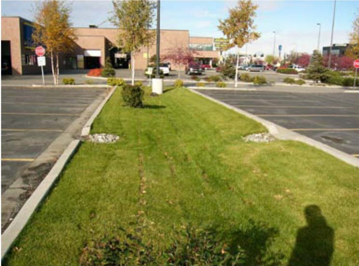
Figure 3-3 Example of Urban Vegetative Buffer in Anchorage

from sheet flow to concentrated flow. Rather than moving uniformly over the surface, concentrated flow forms rivulets that are deeper and cover less area than sheet flow. When flow concentrates, it moves too rapidly to be effectively treated by a buffer. As a rule, flow concentrates within a maximum of 75 feet for impervious surfaces and 150 feet for pervious surfaces (EPA 2009).